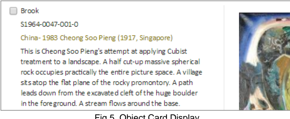
Fig 5. Object Card Display

Object card display: The object number (e.g. S1964-0047-001-0) can be found below the object title.