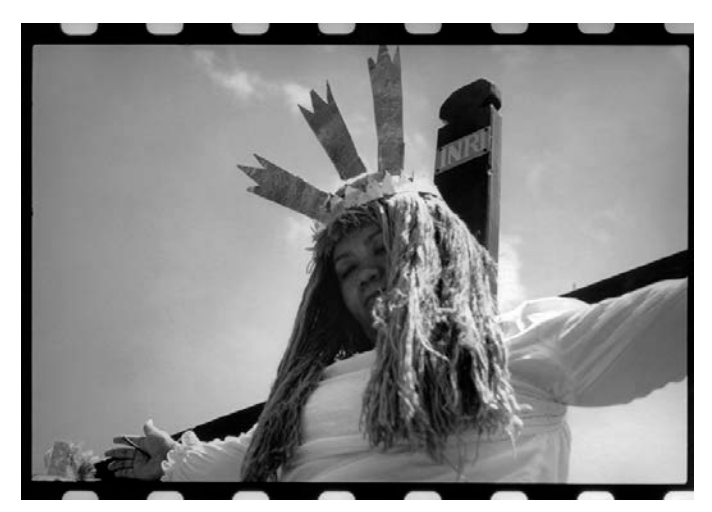
Film still from Nailed, 1992, courtesy of Angel Velasco Shaw.