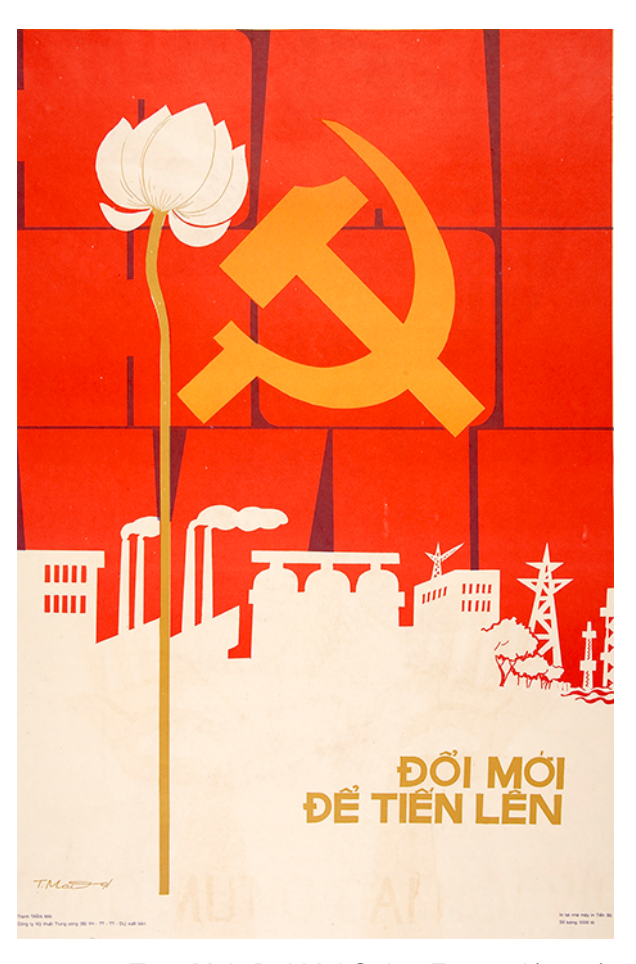
Tran Mai, Doi Moi Going Forward (1991), printed poster on paper, 78 x 54.5 cm.

"Discoursing with images of war are excerpted documentaries, films, and primary source texts that raise the question of how the Vietnam War is officially commemorated, or privately remembered. Complicated and contextualised by the nation- and economy- building of the Doi Moi period, we aim to prompt the viewer to consider the boundaries between memory, heritage, and commemoration," shares exhibition curator Chang Yueh-Siang.